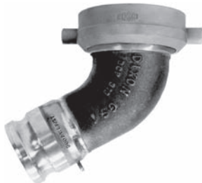
railroad thread swivel nut x 20° adapter