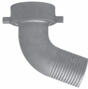
railroad thread swivel nut x 20° hose shank