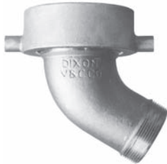
railroad thread swivel nut x 30° male NPT