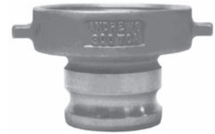
railroad thread x male adapter