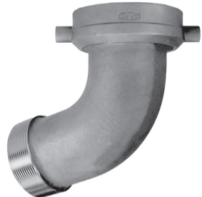
railroad thread swivel nut x 30° male NPT