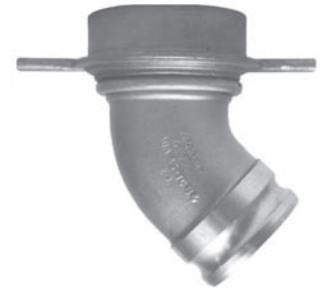
swivel railroad thread x 45° male adapter