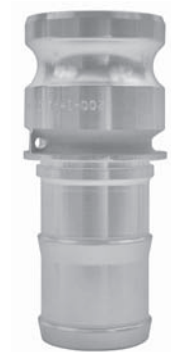
type E Dixon cam &amp; groove