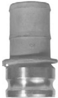
male adapter x hose shank