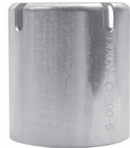
interlocking crimp ferrule