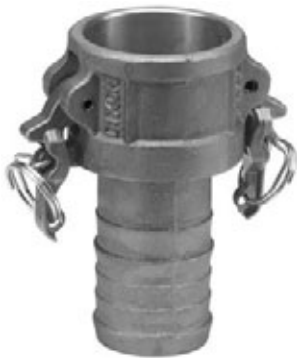
female coupler x hose shank