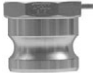
female NPT x male adapter