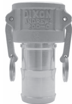
type C Dixon cam &amp; groove