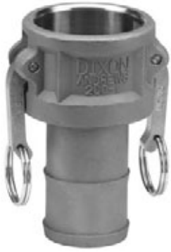
female coupler x hose shank