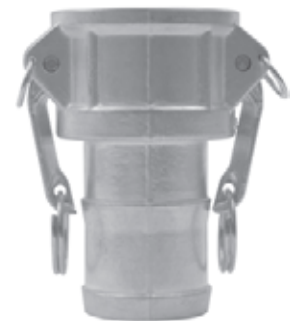
female coupler x hose shank

* ¾" - 4" are A380 die cast aluminum 6" is 356T6 aluminum