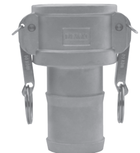
female coupler x hose shank

NOT for use with Interlocking Crimp Ferrules