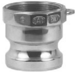
male adapter x female NPT