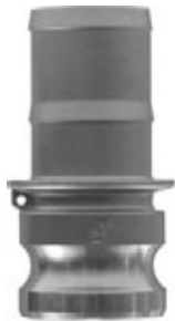
hose shank x male adapter