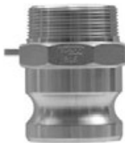
male NPT x male adapter