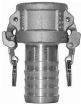
female coupler x hose shank