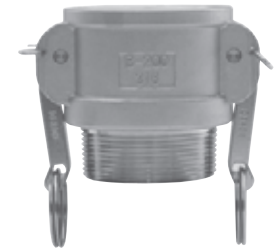
female coupler x male NPT