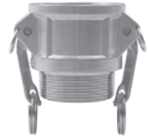
female coupler x male NPT

* ¾" - 4" are A380 die cast aluminum 6" is 356T6 aluminum